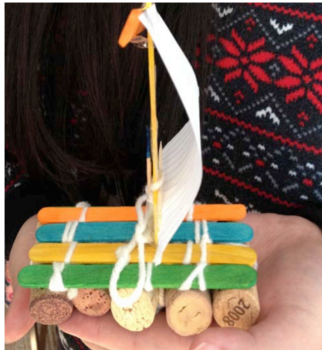
Photo 1. Mini-water craft created by a participant during BSDBJ's activities at a NAPIESV Event March 2014 in Emeryville, CA. This is one of the stories of resilience and strength of a collective healing journey to end sexual violence. It was the first time the participant created a Peace Bangka.

*Photo on Cover. Mini-Bangka from Mindanao, private collection.