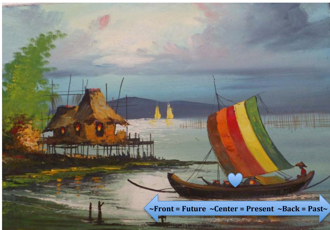
Photo 7. Bangka on Water , private collection of Elizabeth Megino. Unknown painter. Photo shown altered for BSDBJ purposes.

I am Peace Bangka journeying in the Sea of Life with its low and high tides. Outrigger signifies Balance and Harmony Paddles signifies Energy of Motion Sail is your Mindset. The front of the Bangka signifies the Future. The back of the Bangka signifies the Past. The center of the Bangka, where the heart is, represents the Present. © BSDBJ 2014