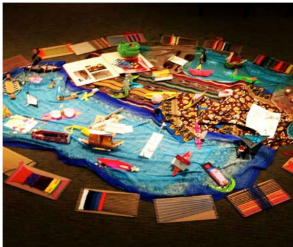
Photo 2. The global connections of woven pieces and completed mini-watercrafts created by participants at NAPIESV's 1 st Summit, San Diego, CA, September 2013. Each has a story of strength and resistance.